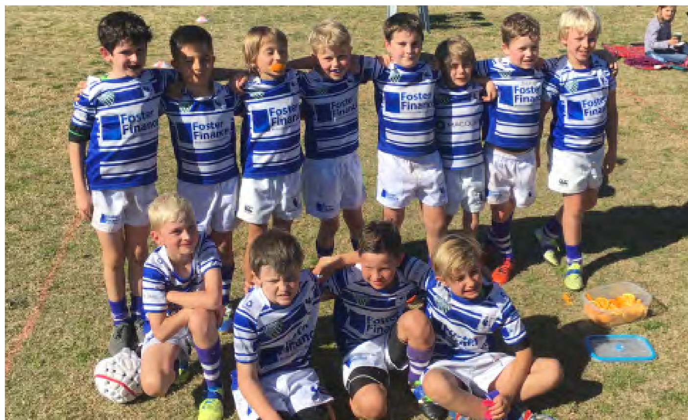
Clovelly Eagles Under 8 Team