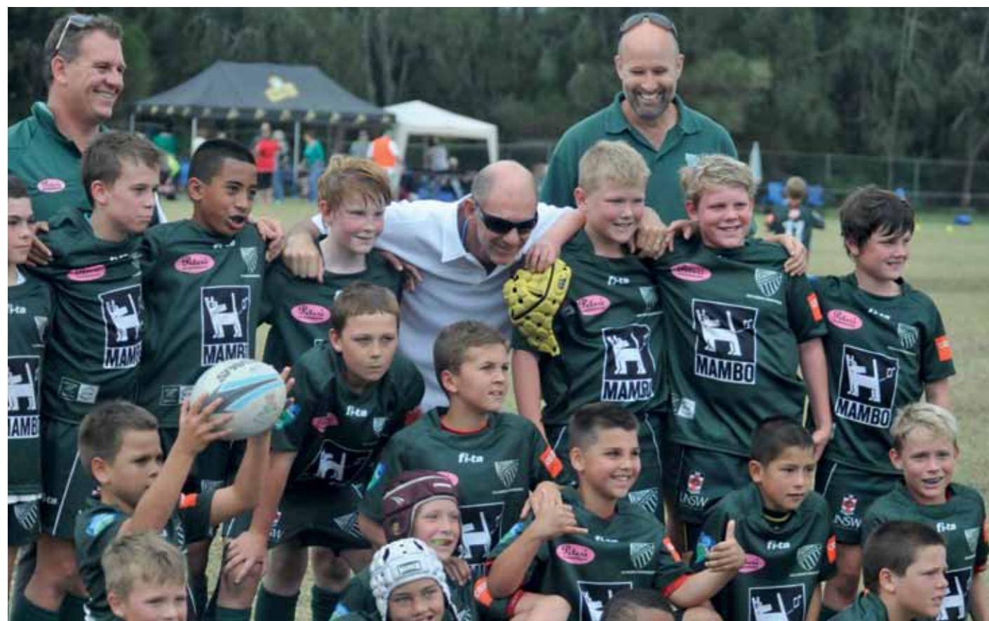
U11 Team Jubilant with 3rd