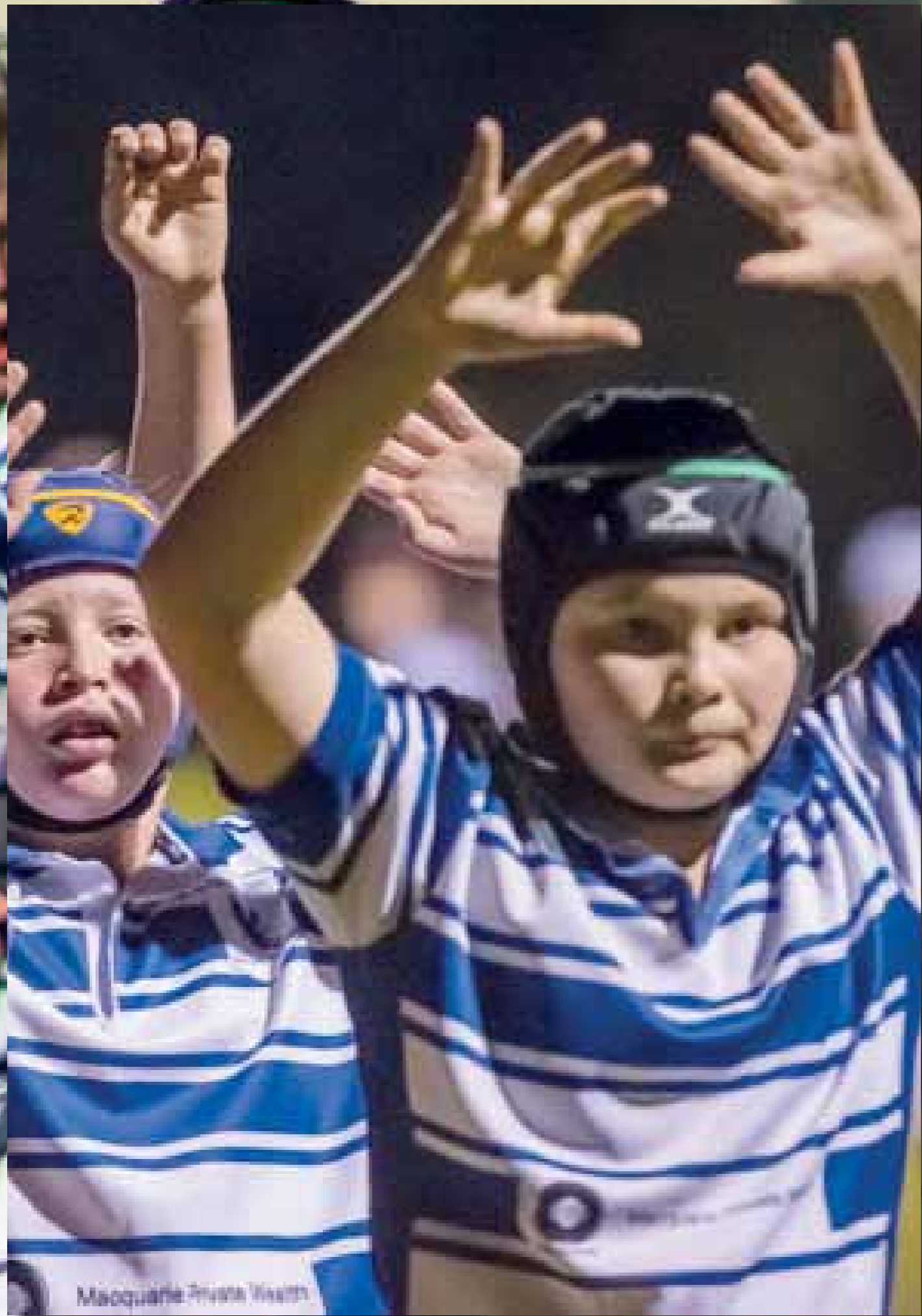
Macquarie Private Schools