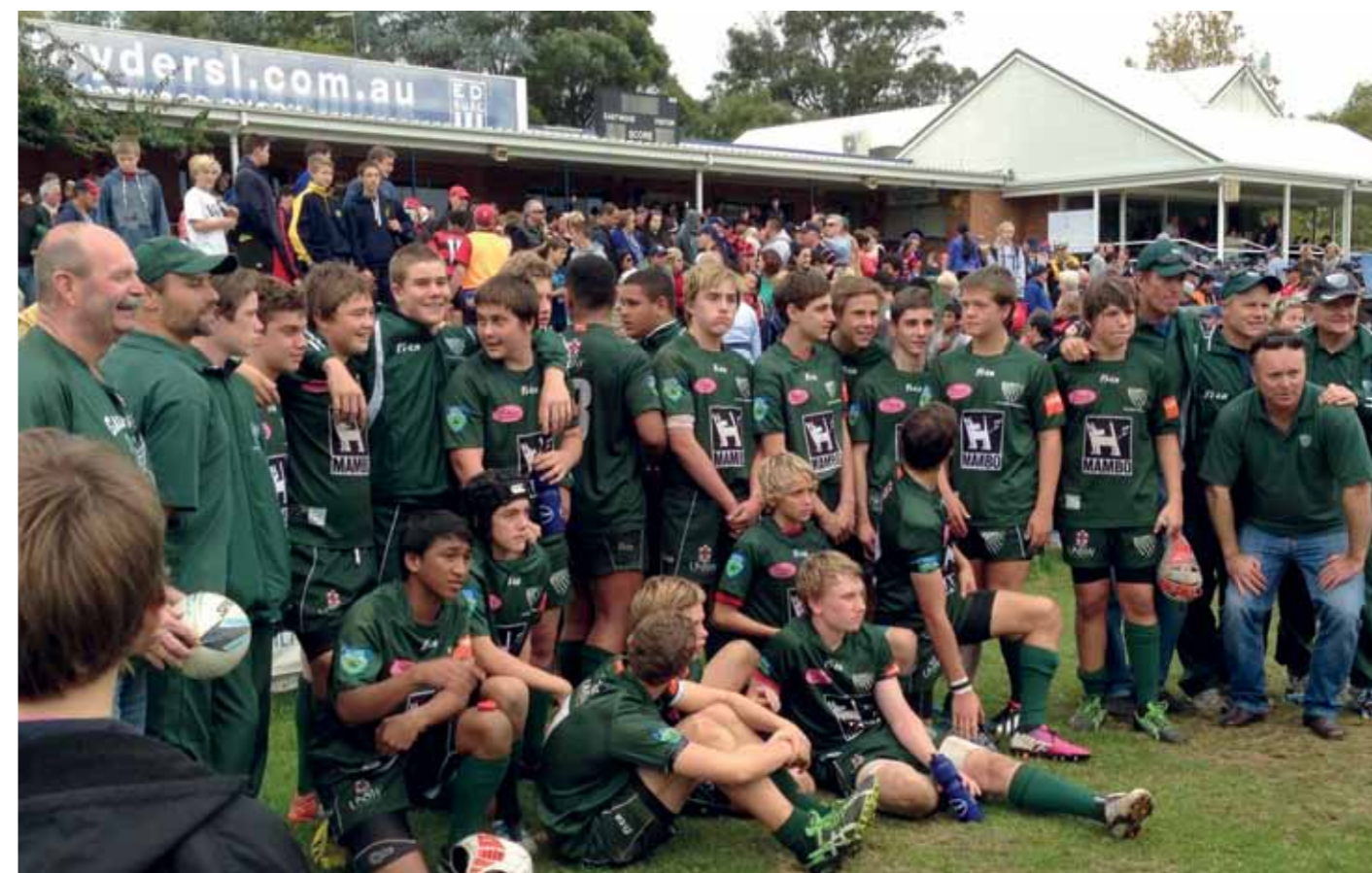
Under 14's at TG Millner after the final against Norths