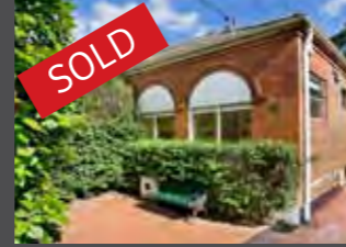
99 St Thomas Street Clouelly