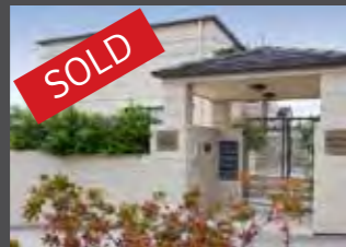
3/55 Arden Street Clouelly