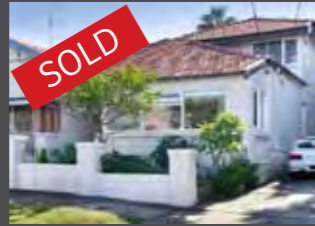
12 Allan Avenue Clouelly