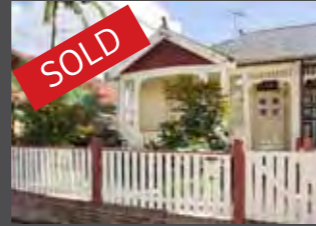
12 Barry Street Clouelly