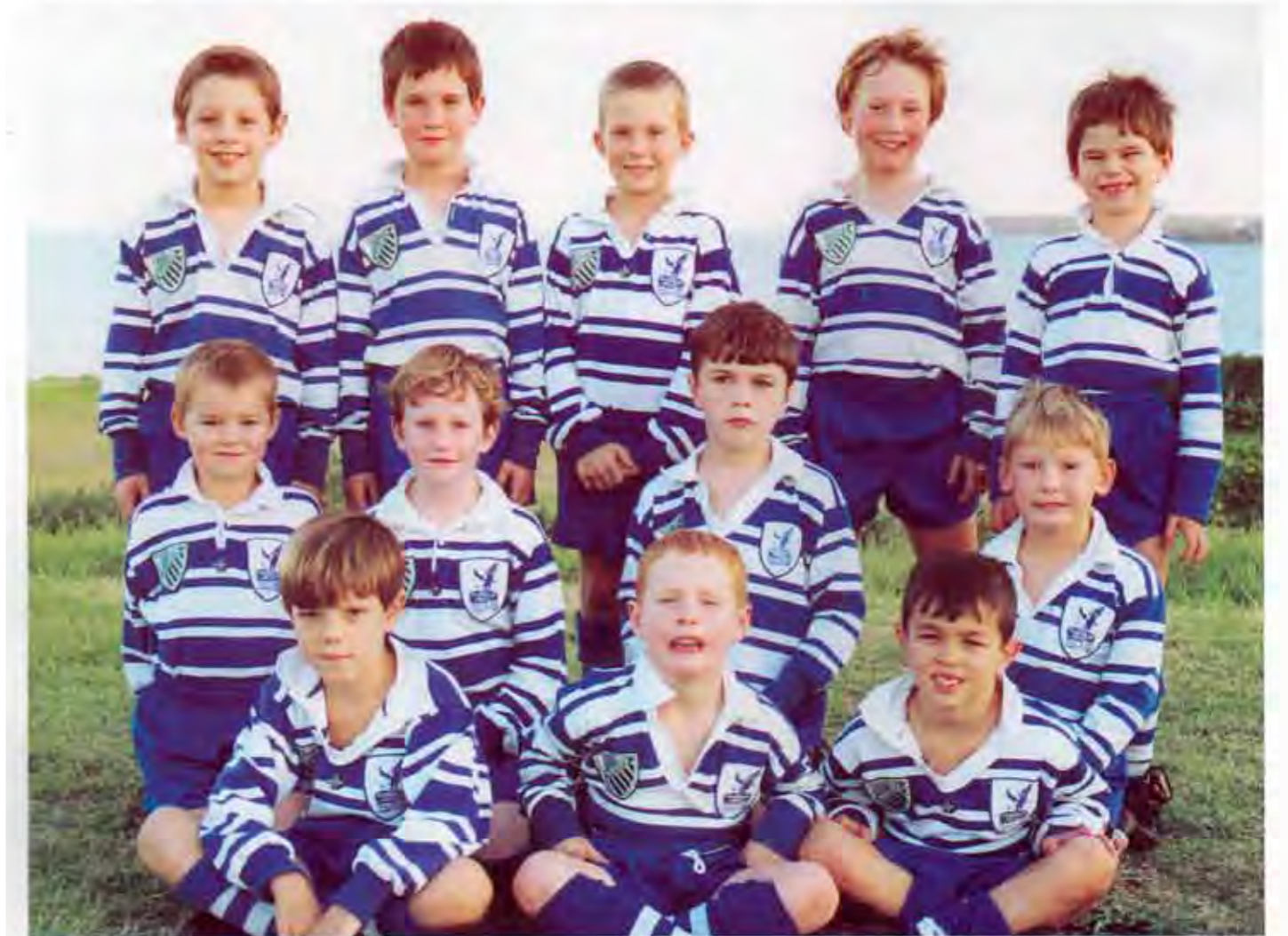
The 2001 premiership winning U7 side, the majority of players in this side also won the U6 premiership the previous year.

It was a privilege to be president of a club with such a tremendous history. The friendships, memories and common bonds that were formed from being part of Clovelly club was, for me, a very rewarding part of life.