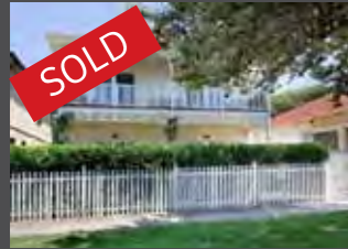
36 Winchester Road Clouelly

Proudly Sponsoring Clouelly Eagles Junior Rugby For Over 15 Years