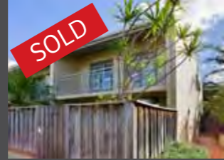
14/1 Fewings Street Clouelly