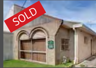
4 Lowe Street Clouelly