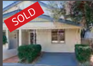
25 Battery Street Clouelly