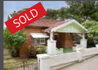
45 Arden Street Clouelly

For All Your Real Estate Needs Contact The Raine & Horne Team Today - Your Local Property Specialists