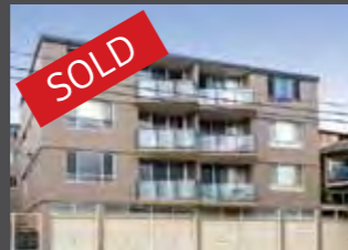
6/316 Clouelly Road Clouelly