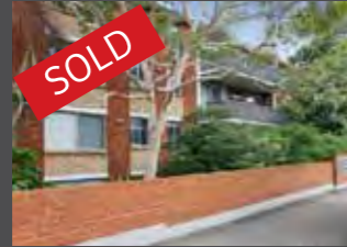
6/37 Arden Street Clouelly