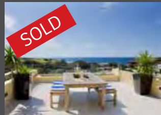
5/44 Melrose Parade Clouelly